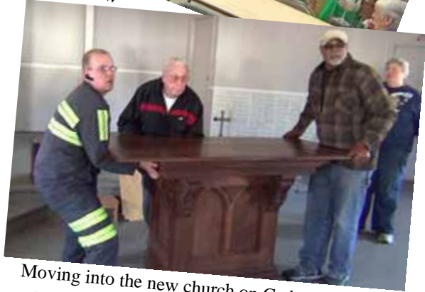
Moving into the new church on Cedar street.