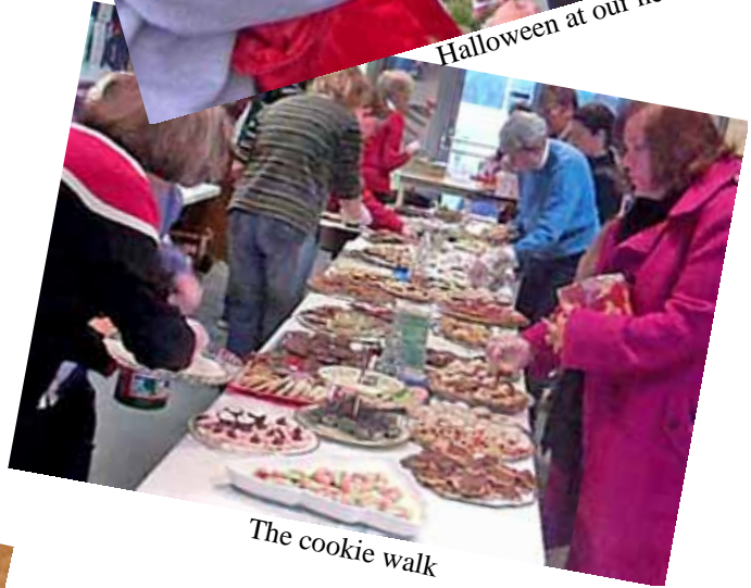
The cookie walk