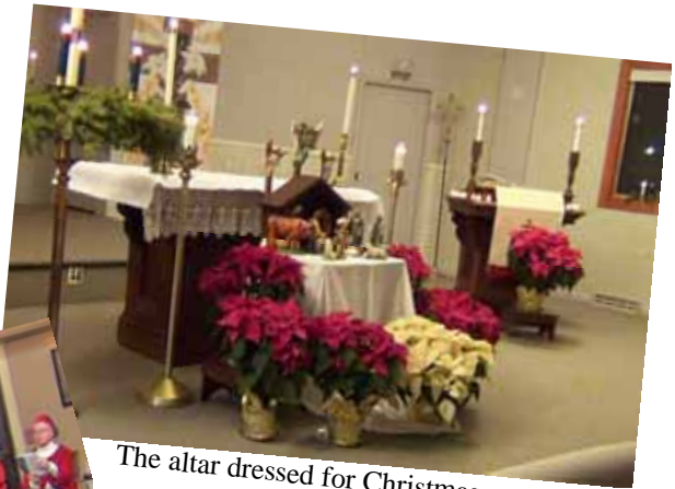
The altar dressed for Christmas