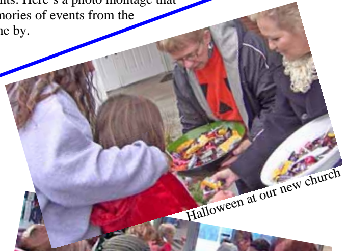
Halloween at our new church