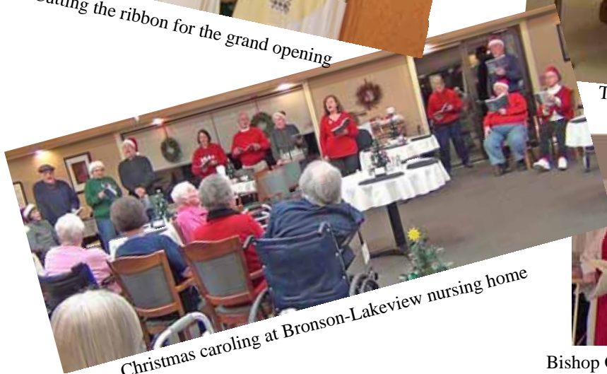
Christmas caroling at Bronson-Lakeview nursing home