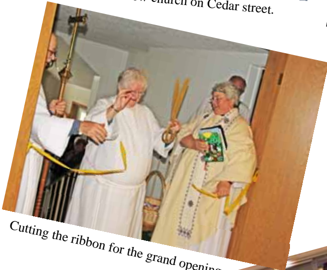
Cutting the ribbon for the grand opening